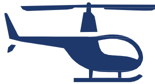
Helicopter = 13 kpl