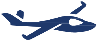
Glider = 17 kpl